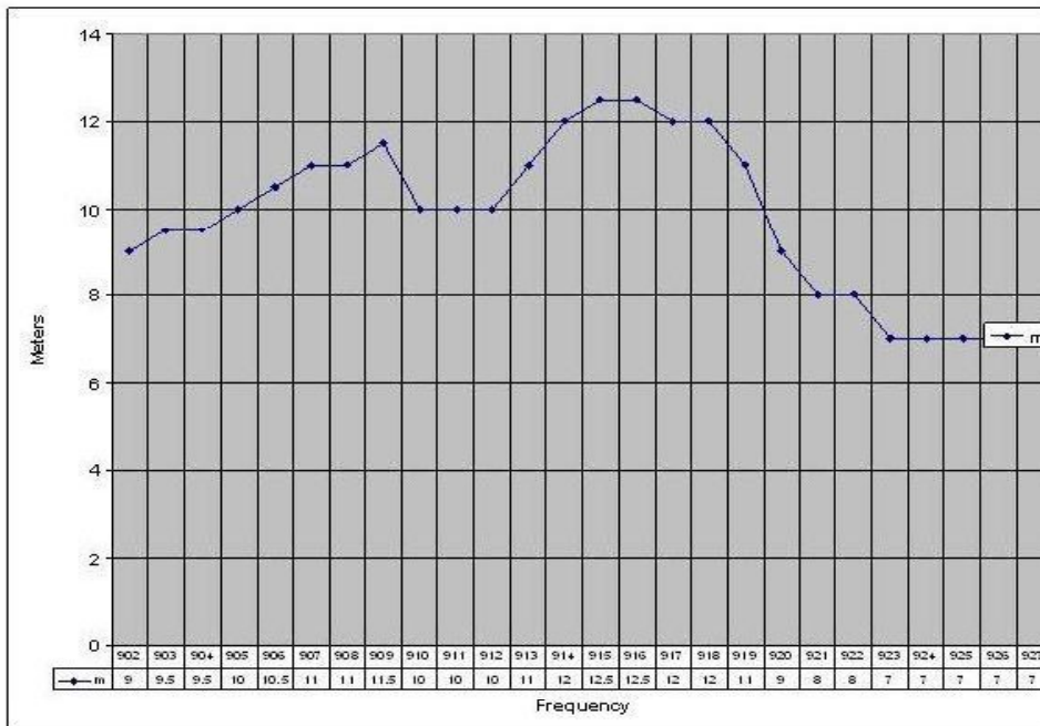
Typical read distance chart - Using a CSL101-2 handheld reader @ 90 deg from target seal